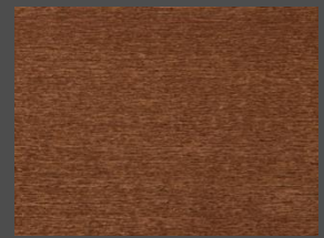
Walnut - Medium