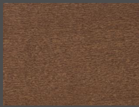
Walnut - Light